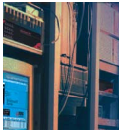
Perfect for server rooms

Once you install the UltraMatrix its value increase since it has flash memory. Firmware updates are available from rose.com . This ensures your product will be compatible with the newest products and technologies. Call us today for more information on this and other Rose products.