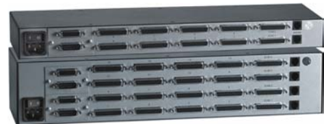
Rear view of UltraMatrix E-series, 2x8 (top), 4x16 (bottom)

■ Phone: 281-933-7673 ■ E-mail: sales@rose.com ■